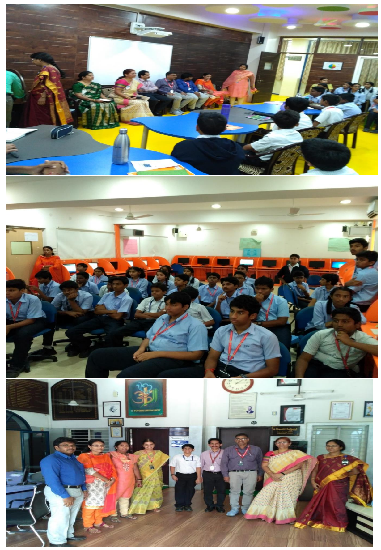
GRIET Team with Students and School Teachers